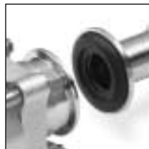
2. Place TS series gasket in groove on either ferrule.