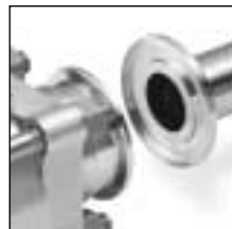
1. If using two TS series ferrules...