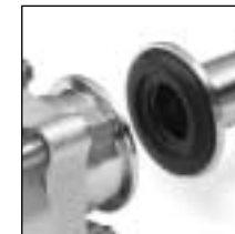
2. Place TS series gasket in groove on either ferrule.