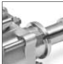
3. Press ferrules together so the gasket is seated in both ferrules.