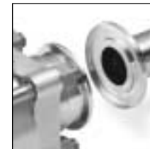
1. If using two TS series ferrules...