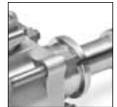
3. Press ferrules together so the gasket is seated in both ferrules.