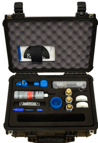
Compact Inspectors Kit - Dimensions: 42cm x 33cm x 17cm Weight: 6kgs

Compact Inspectors Case MS-CASE-CI-IN (Imperial) MS-CASE-CI-MM (Metric)