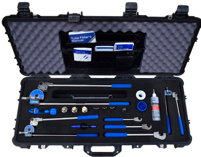
Master Installers Kit - Dimensions: 98cm x 47cm x 16cm Weight: 30kgs

Master Installers Case MS-CASE-MI-IN (Imperial) MS-CASE-MI-MM (Metric)