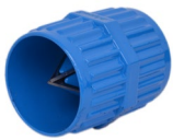
Tube Deburring Tool