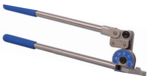
Hand Tube Bender