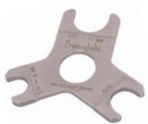
Gas Inspection Gauge