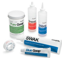
Leak Detectors Sealants