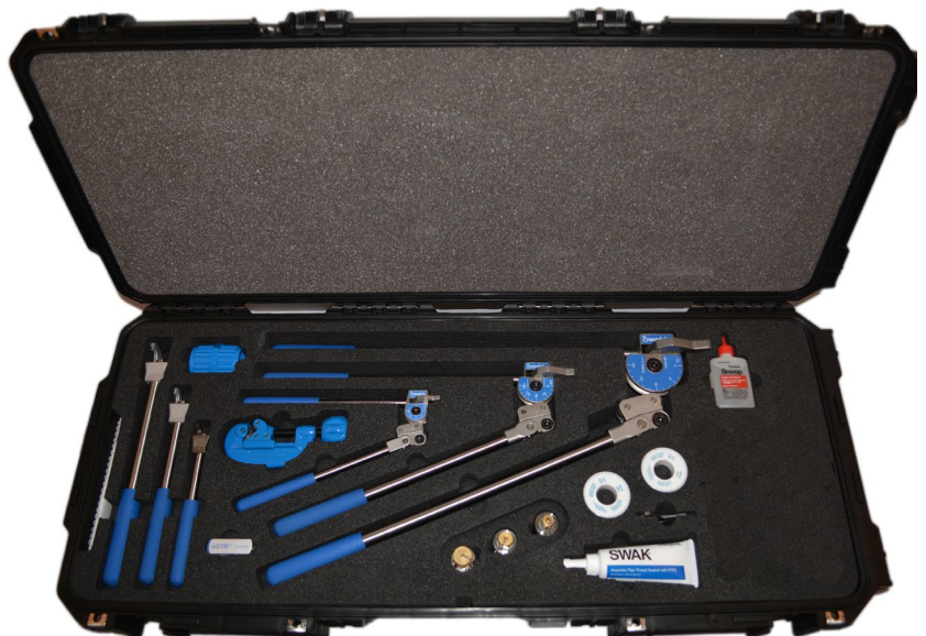
Tool Case large