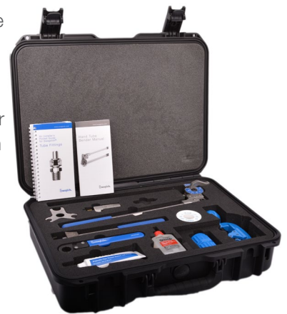
Tool Case small

See backside for more information or contact us directly.