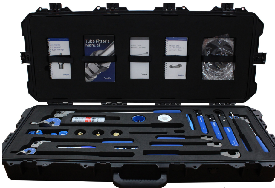
layout may vary

NORDI-TOOLBOX-IM-MASTER (Imperial) NORDI-TOOLBOX-MM-MASTER (Metric)