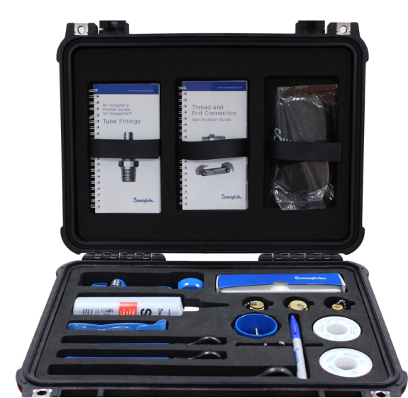
layout may vary

NORDI-TOOLBOX-IM-BASE (Imperial) NORDI-TOOLBOX-MM-BASE (Metric)