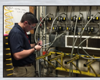
Comprehensive Hose Advisories