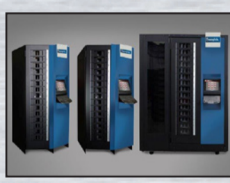
Proven Inventory Management Support