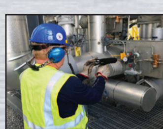
Extensive Energy Evaluations