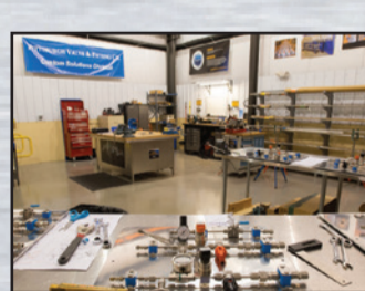
Masterful Custom Fabrication