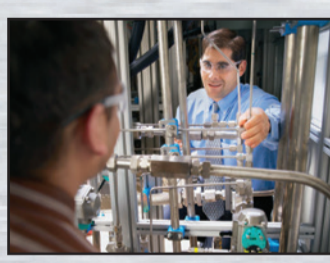
Unparalleled Application Knowledge