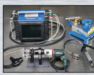
Genuine Swagelok Tool Rentals