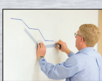
Expert Technical Training