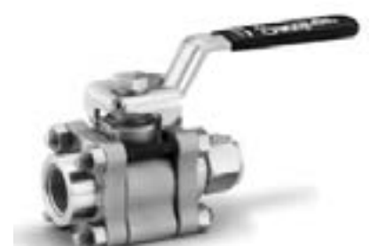
Female Pipe Thread to Swagelok Tube Fitting