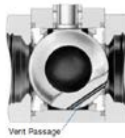
External Vent Option