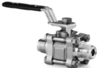
VCR Metal Gasket Face Seal Fitting