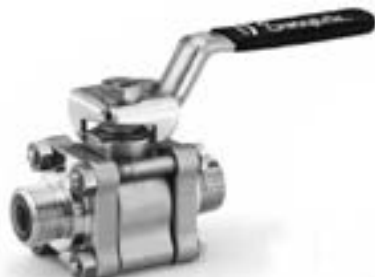
VCO O-Ring Face Seal Fitting