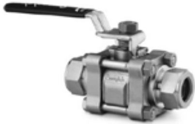
Swagelok Tube Fitting