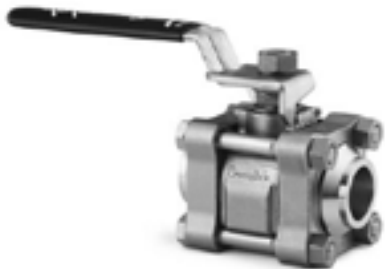
Pipe Butt Weld