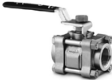
Female Pipe Thread