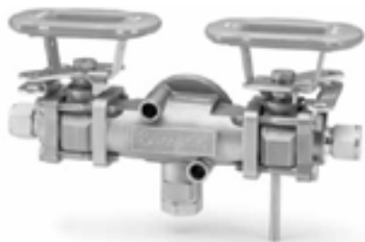
Steam Trap Test Valve

Consists of two 63 series ball valves and a universal mount. Steam trap is not included.