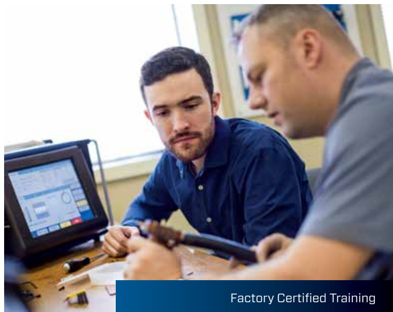
Factory Certified Training