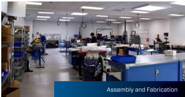
Assembly and Fabrication