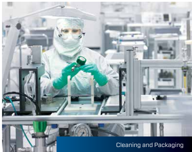
Cleaning and Packaging

Like everything else we provide, our custom solutions services are backed by our Limited Lifetime Warranty.