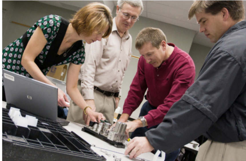
Students participate in an interactive exercise, designing and building a sampling system.

Learn more about PASS training at swagelok.com .